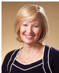
Honourary Chair: Mrs. Laureen Harper